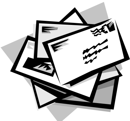
Please keep us informed of any address changes so we can keep our records up to date.

Every Thursday - Food Pantry 4:30-5:30 pm Nov 2 - Elders Meeting 5 pm Nov 3-10 - Winfreys on Vacation Nov 5 - Daylight Savings (Fall back 1 hour) Nov 6 - Fellowship Meal after Worship Nov 9 - Elders/Deacons Meeting 5 pm Nov 16 - Daycare Committee Meeting 5 pm Nov 17-20 - Nat'l Missionary Conv. in Atl. Nov 20 - 40th Anniversary Sunday!! Nov 22 - Deadline for Nov. Newsletter Nov 23 - Wed night meal/Study Cancelled Nov 24 - Thanksgiving Day (Pantry Closed) Nov 30 - "Deck the Halls" for Christmas! Servers for November: Morning Prayer - Chuck Cleghorn Communion Meditation - Kevin Berg Offering Prayer - Pat Conrad Server - Bill Grist Communion Preparation - Amanda Duke