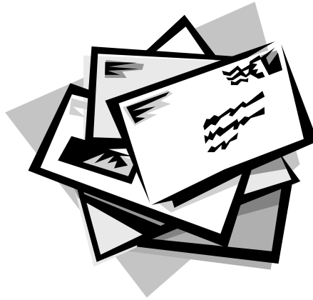
Please keep us informed of any address changes so we can keep our records up to date.

General Prayer Items for the month: (Please see the weekly bulletin for the church prayer list.)